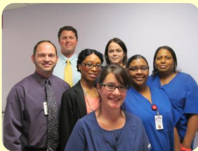
Turning Point Staff

For more information about Turning Point call 662-779-0173